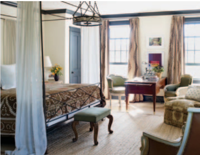
Window frames and trim in the master bedroom were painted a shade of ash to articulate the space's architecture.