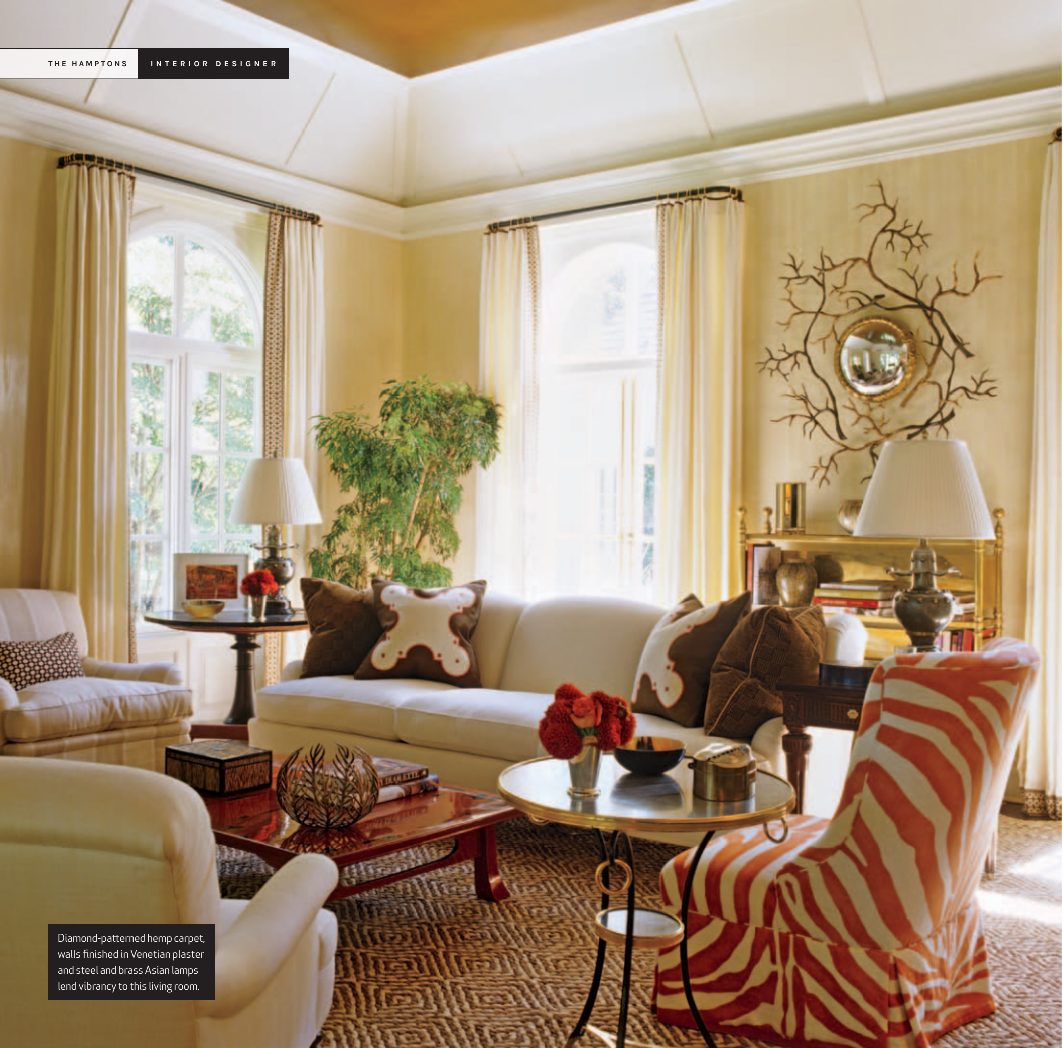
Diamond-patterned hemp carpet, walls finished in Venetian plaster and steel and brass Asian lamps lend vibrancy to this living room.