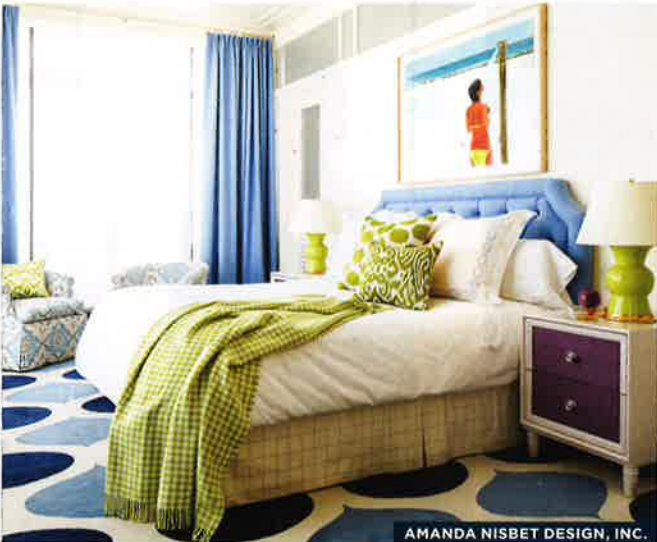
AMANDA NISBET DESIGN, INC.