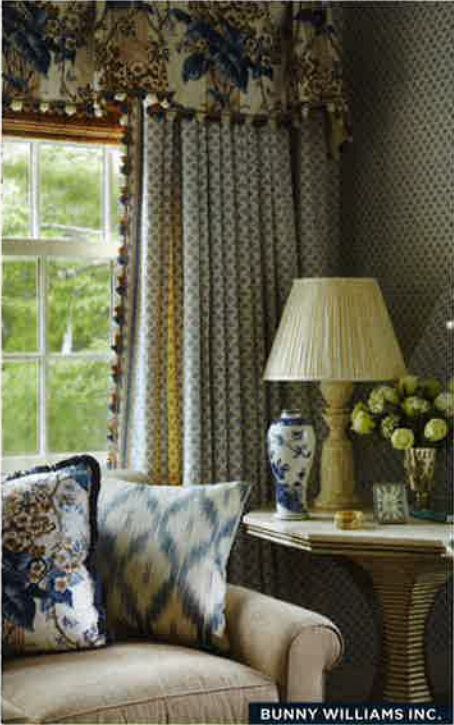
BUNNY WILLIAMS INC.

TRADEMARK: Captivatingly bold use of modern materials, bracing color, and touch-me textures