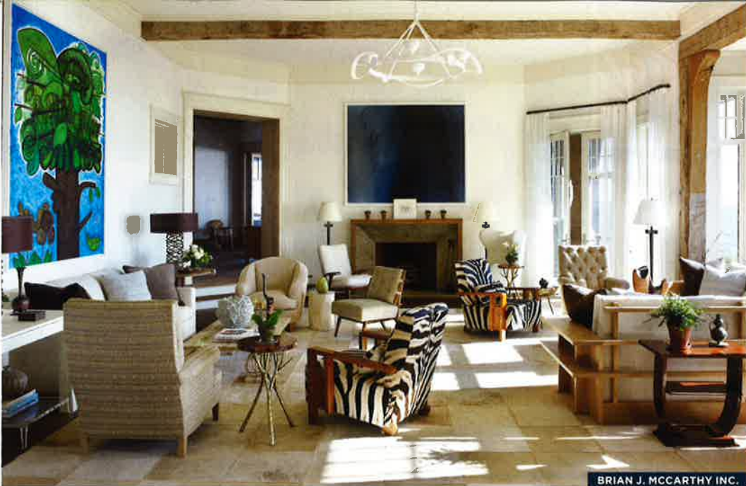
BRIAN J. MCCARTHY INC.