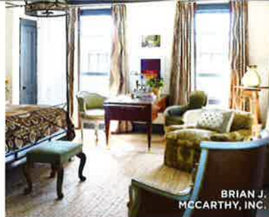
BRIAN J. MCCARTHY, INC.